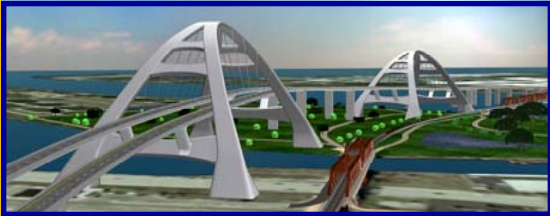
Ambassador Niagara Signature Bridge