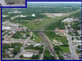
Central Avenue, Fort Erie