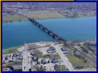
International Railroad Bridge