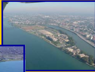
Squaw Island, Buffalo