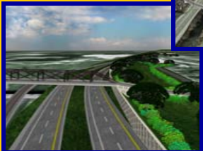
Canadian corridor between QEW and bridge