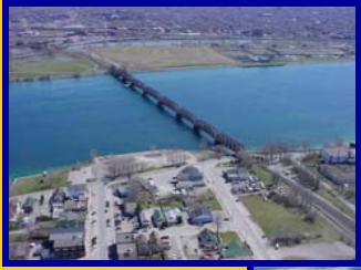
International Railroad Bridge