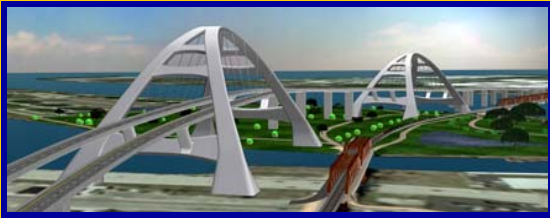
Ambassador Niagara Signature Bridge