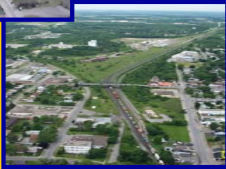
Central Avenue, Fort Erie